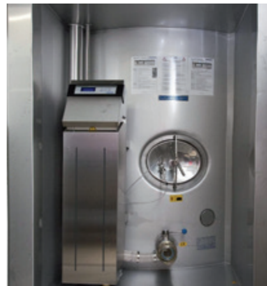
Alcove Stainless steel alcove with built-in MIII cooling and cleaning control system