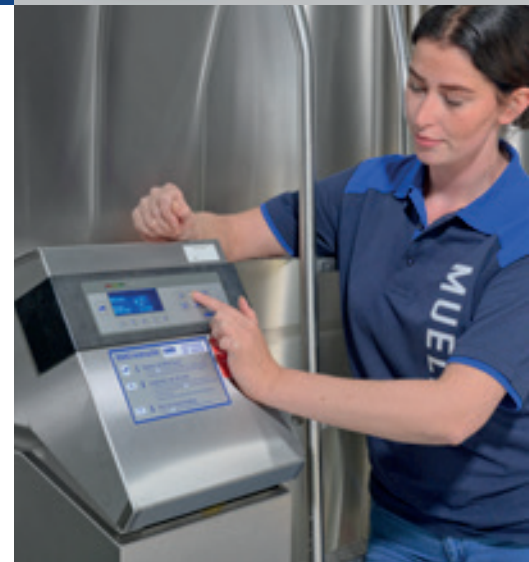
MIII Control Unit Large display showing milk temperature, date, time and system information in several languages